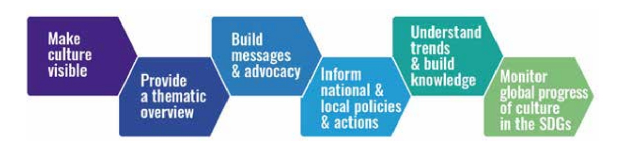
Figure 1. Culture | 2030 Rationale

THEMATIC INDICATORS FOR CULTURE IN THE 2030 AGENDA